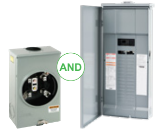
Meter socket Outside MB load center Outside